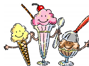
Ice Cream Social